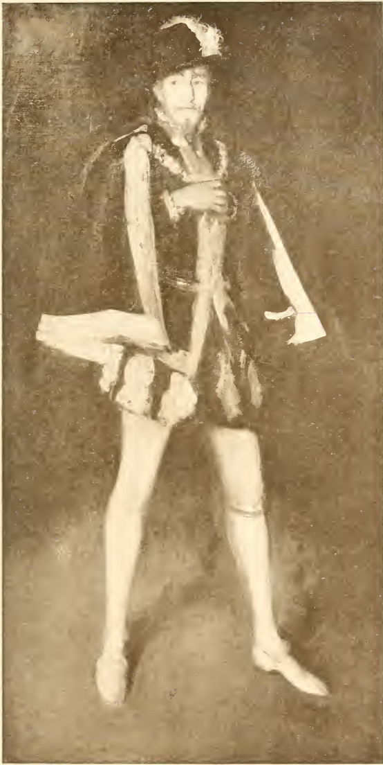
Arrangement in Black, No. 3.